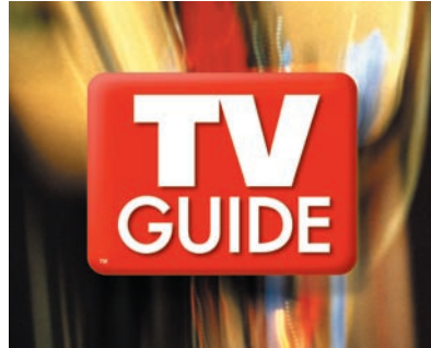
Against a photograph or other complex background/footage. In this case, you must consult Corporate Marketing for sign-off on your artwork. The drop shadow is very subtle and must be used carefully. Every new photograph or background presents a new design challenge.