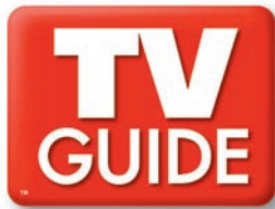
Against 100% White Background.