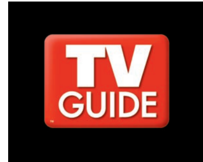
Against 100% Black Background. In this case the drop shadow will disappear.