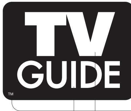
Preferred Black & White Logo