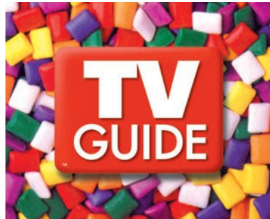
Against a photograph or other complex background/footage. In this case, you must consult Corporate Marketing for sign-off on your artwork. The drop shadow is very subtle and must be used carefully. Every new photograph or background presents a new design challenge.