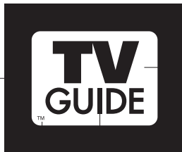
Alternate Reversed Black & White Logo

Please see "Do's & Don'ts" for more specific details on Black & White Versions.